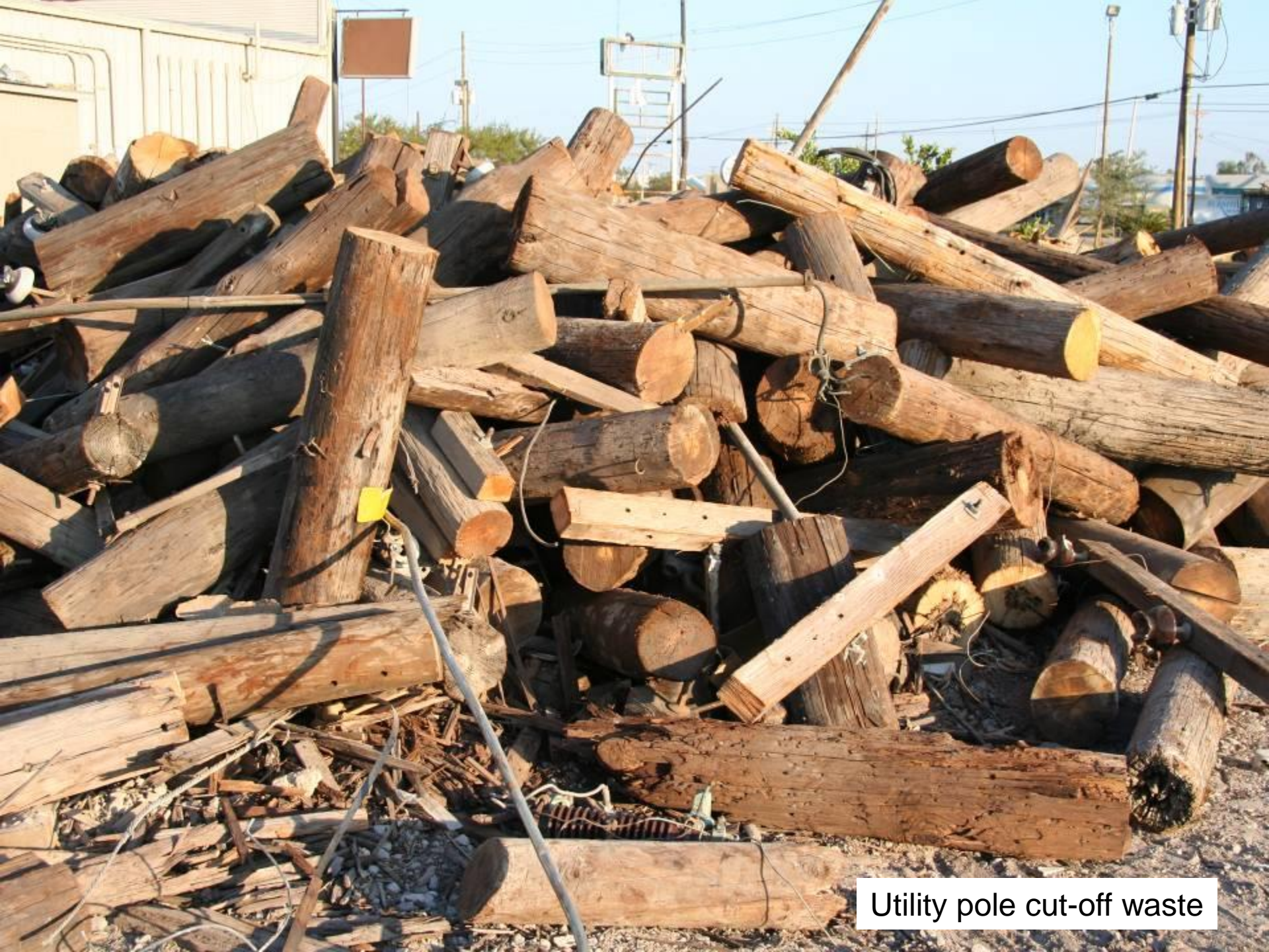
Utility pole cut-off waste