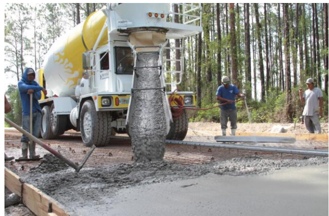
Figure 1: Hot mix asphalt and Portland cement concrete pavements with WTE bottom ash included as a partial aggregate replacement being placed as part of a pilot project at the Pasco County Resource Recovery Facility.